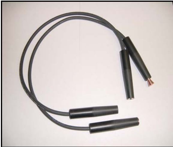
USJL-001 JUMPER LEAD SET