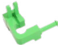
*add "F" for Hi Visibility

Works on a 50 ft telescopic or an 8 ft bucket stick.