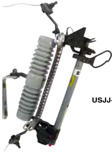
USJJ-006 27 kV SMD-20 Cutout Bypass Tool