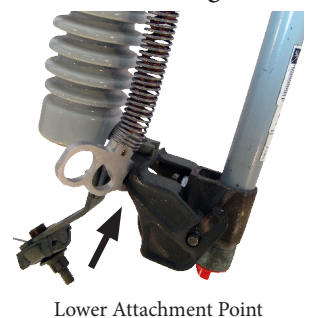
Lower Attachment Point