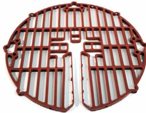
USVS-002 16" Varmint Shield - Red USVS-004 20" Varmint Shield - Red