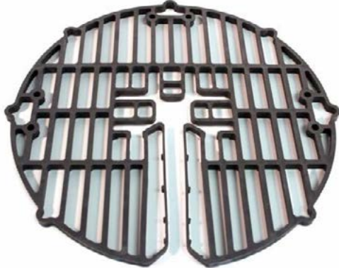
USVS-001 16" Varmint Shield - Gray USVS-003 20" Varmint Shield - Gray

The Varmint Shield is a proactive approach to eliminating animal related electrical service interruptions on transformers, substation insulators, and bushings. The unique design permits the unit to be installed quickly with an insulated shotgun stick and without the need to drop service or expose a lineman to energized equipment during installation.